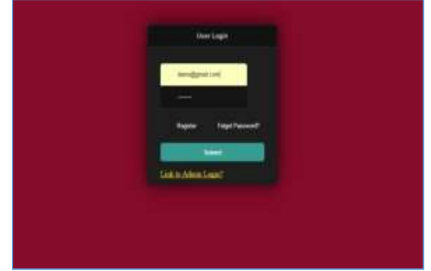
Figure 3 : User Login Section

[Gursal* et al. , 5(12): December, 2016] IC<sup>TM</sup> Value: 3.00